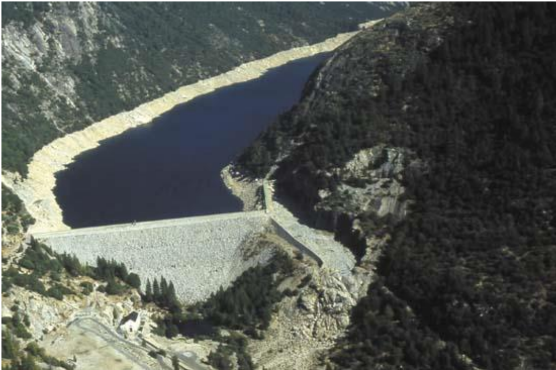
Salt Springs Dam on North Fork Mokelumne River

MOKELUMNE RIVER HYDROELECTRIC PROJECT (P-137)