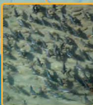
Pink salmon crowd the Skagit in 2009.

NORTH CASCADES ENVIRONMENTAL LEARNING CENTER The 2005 completion and ongoing support of a world-class environmental education center on the shores of Diablo Lake.