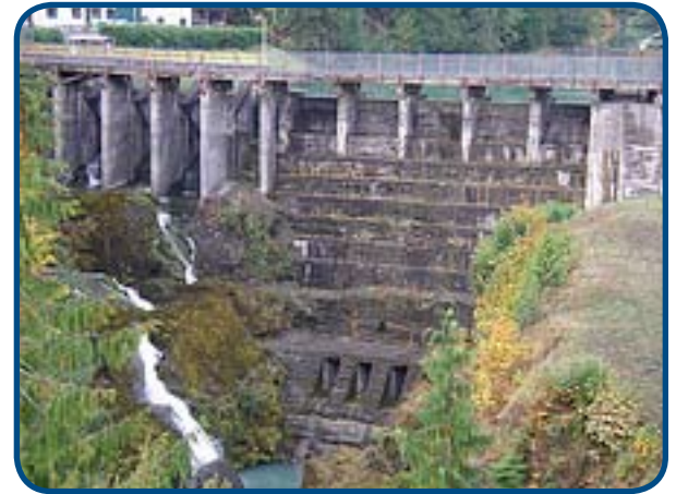
Elwha Dam, WA

These small dams often produce substantially less power than advertised: hydropower facilities rarely if ever generate at their full nameplate capacity. Hydropower dams are typically capable of an output that is only 40-50% of their stated nameplate capacity. The output of low-power hydropower dams is even further constrained by seasonal water availability. In many areas, rivers flow at their highest in the winter and the spring, when the demand for power is at its lowest. On many streams, the flows needed to sustain full generating capacity are available only rarely, following storms or during periods of high spring snow melt. On other streams located in colder climates, or at higher elevations where below freezing temperatures reduce water flow during much of the winter, hydropower dams cannot produce power consistently for much of the year. Many low-power projects also cannot reliably generate power when it is most badly needed: during summer months, when the demand for power is highest, river levels are at their lowest.