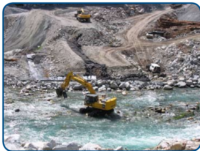
Ashlu Creek, Squamish B.C.

The terms “small,” “incremental” and “micro” hydropower might evoke images of covered bridges, water wheels, and mill dams, but the reality is quite different. While there is no one definition for any of these terms, it usually refers to the dam's nameplate generating capacity and not to the size or environmental footprint of the dam or reservoir. For example, the state of California considers any hydropower facility that generates less than 30 megawatts to be small; but other descriptions can range from 1 to 50 megawatts. A more accurate description of most of these projects would be “low-power,” as the dams themselves are often quite large. For example, based on capacity each of the following dams can be described as “small” hydro: