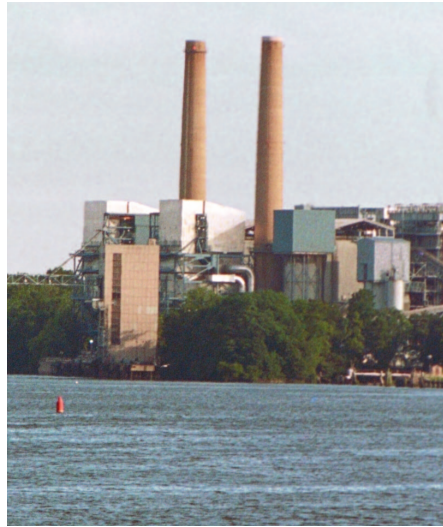
An uncertain future challenges water planners.

In view of the magnitude and ubiquity of the hydroclimatic change apparently now under way, however, we assert that stationarity is dead and should no longer serve as a central, default assumption in water-resource risk assessment and planning. Finding a suitable successor is crucial for human adaptation to changing climate.